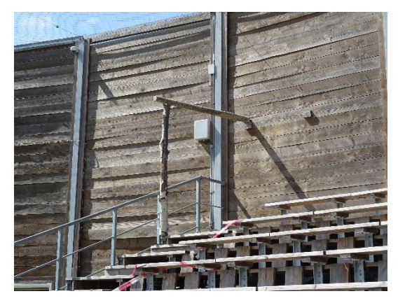
Figure 10: Change 4