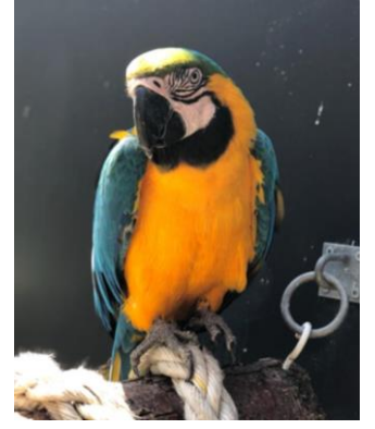
Figure 3: Jacky

At Landgoed Hoenderdaell there has been a birds of prey demonstration since the beginning of the park. But starting in 2017 the park changed the way they housed their demonstration birds and they not only wanted birds of prey anymore, but also other kind of birds. In 2018 we opened our new location, the Avitorium. At this point we moved all 7 macaws together to 1 big aviary. For our demonstration, our ultimate goal is to fly them out of their aviary into the demonstration area, have them fly around, land on their specific stations and then que them to get back into their aviary.