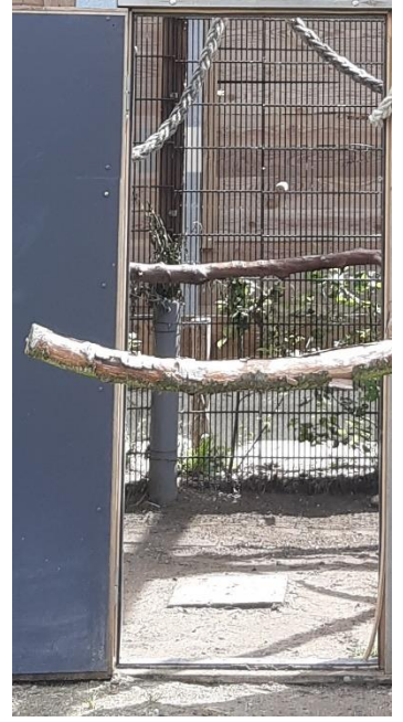
Figure 7: Change 1

The second change we made was quit accidental. We put up a high bar in the arena for one of our other birds. But it seemed a good landing place for our macaws. Even for Loes.