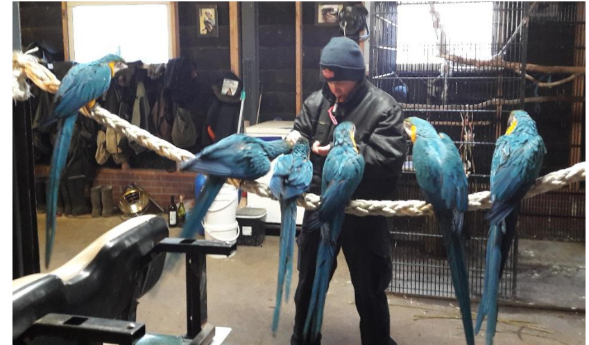
Figure 5: Training in the old shed

It should be noted, that our arena is covered by a net. So we do not have to worry that they will fly away and we can give them the opportunity to practice their flying in the arena.