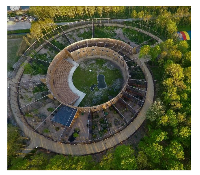
Figure 4: The Avitorium from above