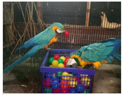
Figure 1: Piet en Loes

• Piet en Loes: born in 2015 and arrived in 2016 at Landgoed Hoednerdaell. When they arrived they were both clipped. They were put together in an aviary and they became a pair. In 2017 we let their wing grow back and started to train them indoors to fly in our new demonstration.